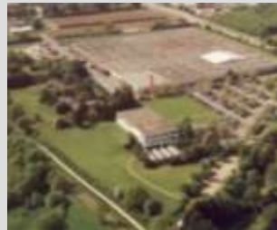
Hako-Werke GmbH main factory site and head office Bad Oldesloe, Germany

We have production facilities on various sites: