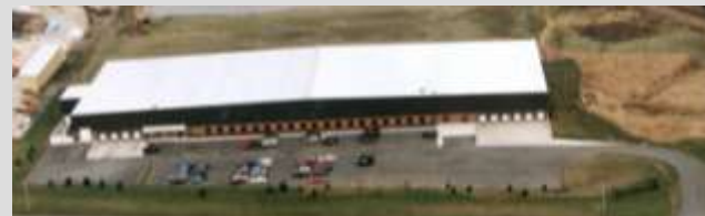
Minuteman Intern. Inc., Hampshire, USA