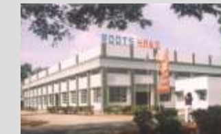
Roots Multiclean Ltd., Coimbatore, India