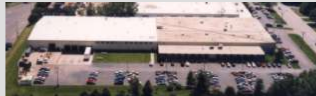
Minuteman Intern. Inc., Addison, USA