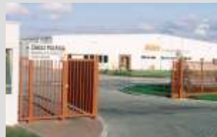
Hako-Technology Sp.zo.o. Koszalin, Poland