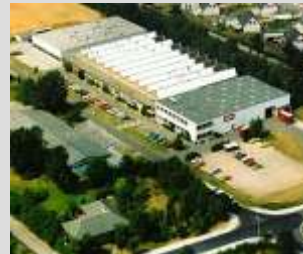
Hako manufacturing branch in Trappenkamp/Bad Segeberg Germany