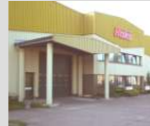
Hako manufacturing branch in Glindow near Potsdam, Germany