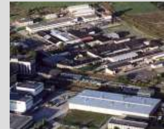
Hako manufacturing branch Multicar Waltershausen/Thür. Germany