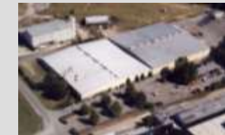
PowerBoss, Aberdeen, USA