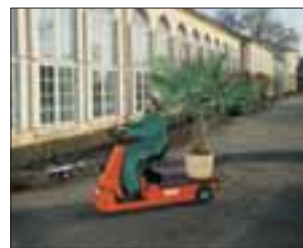
Also ideal for open air applications on consolidated tracks.