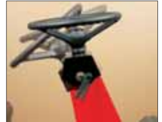
Adjustable steering wheel.