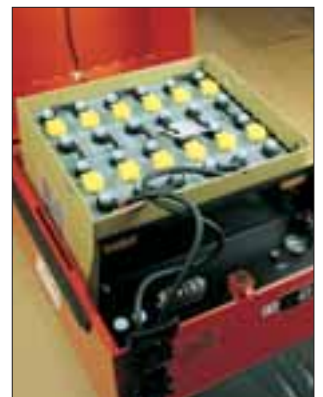
Traction battery Hako-Sherpa MX