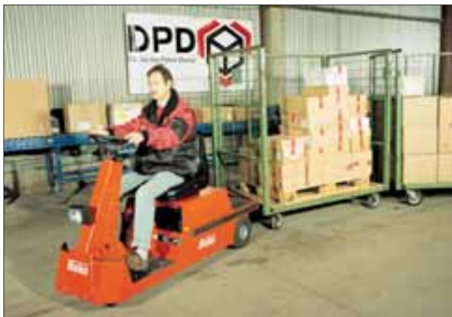
Rapid distribution with a conveyor belt and an Hako Sherpa trailer combination.