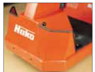
Solid steel frame with robust impact and foot protection.