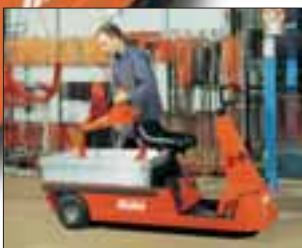
Hako-Sherpa with special loading platform for varnished components.