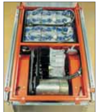
3,0 kW drive motor.