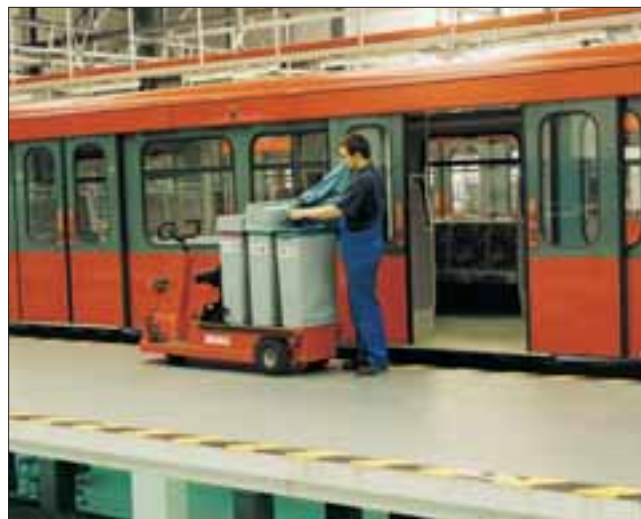
A mobile team of cleaners provides rapid cleaning.