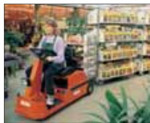
The pulling power of attractive sales stands.