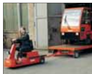
With up to 2 tons being towed.

Hako-Sherpas delivering spare parts in the municipal rail depot.