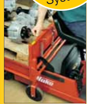
The patented Hako piggyback system