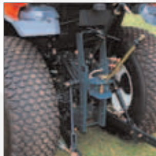
Rear power lift category 1, lifting capacity 1000 kg. Tow bar height adjustable without using tools, jaw or ball-head type.