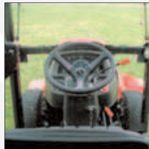
Controls and instruments arranged directly in view of the driver. Large window area for perfect all-round vision.