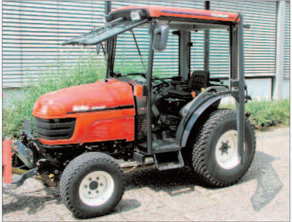
Comfortable cab with generously sized windows and wide-opening doors ensures good all-round visibility of the working area and of attached tools. The cab constitutes a totally enclosed cell, decoupled from the tractor chassis, thus offering optimum protection against noise and vibration, all within an overall height of less than 2 m. Powerful heating and ventilating system with 8 outlet vents and recirculation mode ensures pleasant working conditions.