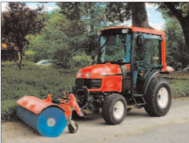
Hakotrac 3100 DA with 2-speed front sweeper 1.60 m width; for thorough cleaning of external areas. Also with dirt collection container and side brush. Can be used as snow sweeper in winter.