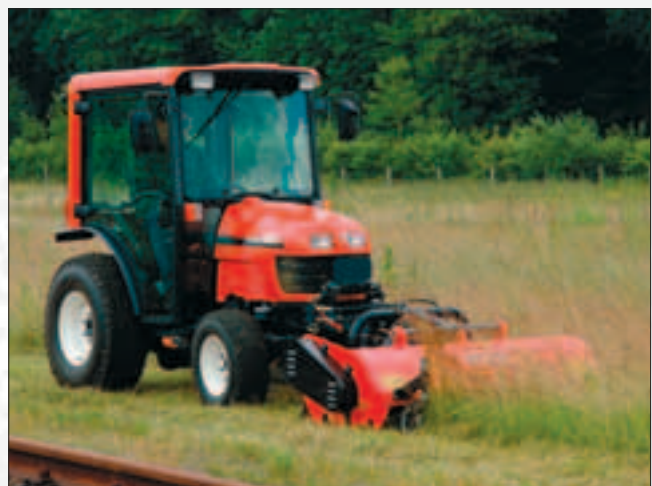
Hakotrac 3100 DA with front-mounted rotary mower 1.50 m width. A high performance for economic mowing of large external grounds. Optionally with various grass collection systems up to 1600 ltr. capacity.