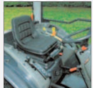
All controls clearly and unambiguously marked and arranged for easy handling. Driver's seat with multiple adjustment settings.