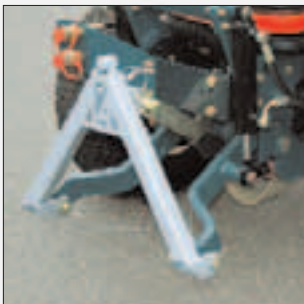
Front power lift with attachment triangle Cat. 0, lifting capacity 700 kg, two bidirectional hydraulic cylinders, integrated front PTO shaft.