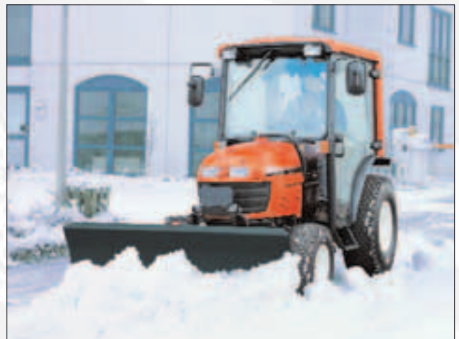
Hakotrac 3500 DA with snow clearing board or snowplough; punchy performance in winter conditions, clearing up to a width of 1.72 metres. Gritters or salt-spreaders can be used in combination with snow-clearing.