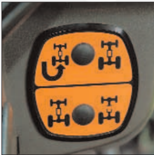
Four-wheel drive that can be engaged under load. Dual speed function for protecting lawns when performing tight turns

Environmentally-friendly and powerful direct-injection Diesel engines combined with a 3-speed hydrostatic transmission and up to 30 km/h transport speed are the basis for cost-effective use of these new tractors.