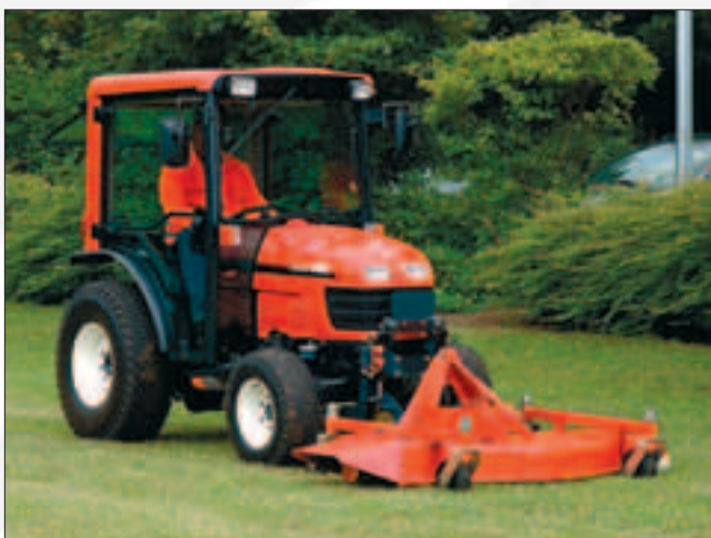
Hakotrac 3100 DA with front-mounted flail mower 1.40 m width. For quick and effective mowing of large areas. Hydraulic side shifting allows the mower to reach out beyond the line of the vehicle to mow banks or hollows.

Alternative means of financing can be tailored to your requirements: Purchase, hire, leasing, rental, full service.